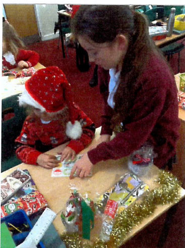
The FOMS team

Have a very Merry Christmas and thank you for your continued support.