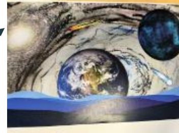
Chloe's art progression