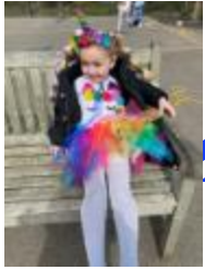
Lots of different hairstyles