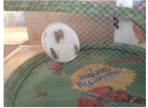
Our butterflies have hatched