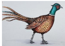
Pheasant Class (Year 4)