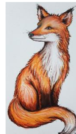
Fox Class (Year 5)