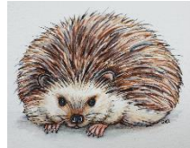
Hedgehog Class (Year 1)