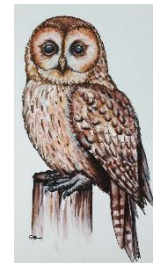
Owl Class (Year 6)

In each class, a variety of whole class, group or individual teaching takes place, depending on the subject and each child's need. EYFS follow the Early Years Foundation Stage and the rest of the school plans together in phases from a 2-year rolling programme: Years 1 & 2, Years 3 & 4 and Years 5 & 6. As a result, sometimes classes work together for topic work, assemblies or story times. Whole school Collective Worship take daily with EYFS joining the school at various time across the school year. Details of our curriculum and Collective Worship can be found on our website.