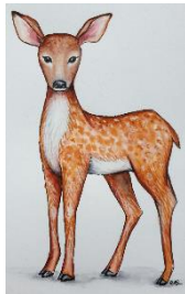
Deer Class (Year 3)