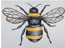
Bumblebee Class (EYFS)

At Moreton there are 7 classes, each with approximately 30 children. Children are taught in year groups and move through the school with their peers. There are three infant classes (Key Stage 1) and four junior classes (Key Stage 2):