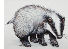
Badger Class (Year 2)